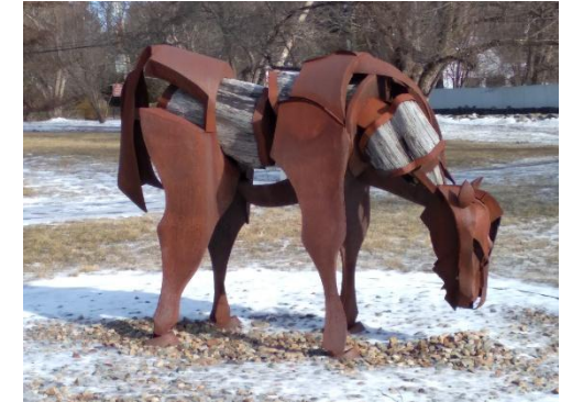
Rich Sis by Jamie Burnes, Weston sculptor

Both loops are mostly flat and on paved surfaces for an AVA rating of 1A. Trail would be doable for strollers, but might be difficult for wheelchairs due to the trail through the woods, the short and grassy path, and uneven pavement in some places.