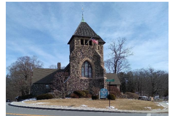
First Parish Church

More information on walk events and Walk 'n Mass Volkssport Club at: