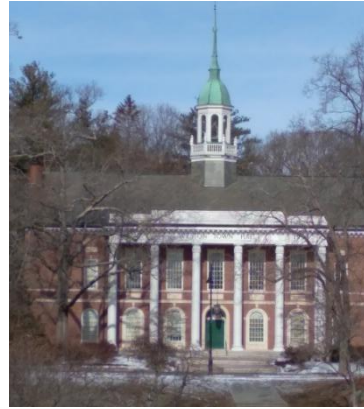
Weston Town Hall (built 1917)

BRIEF HISTORY: Weston, incorporated in 1713, is only 15 miles west of Boston but has a semi-rural feel to it with 18 percent of the acreage preserved as open spaces, many scenic roads, and historical buildings.