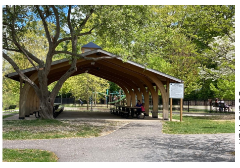
Pavilion at Choate Park, which also has a pond and a playground with splashpad nearby

Our August 3 Club Picnic in Medway's Choate Park is a bring-your-own picnic lunch; appetizers or desserts to share would be welcome. Note this is a carry-in/carry-out facility so all trash departs with you.