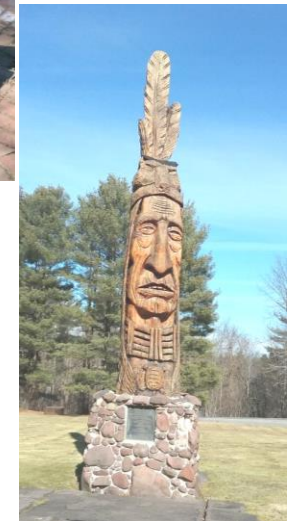
Right: Statue at Route 5 entrance to Forest Park, created by Peter Wolf Toth to represent Omiskanoagwiak