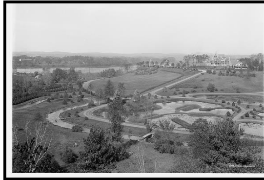
Laurel Hill & Aquatic Gardens of Forest Park, 1910-1920, Springfield, MA

PROCEDURE: Each participant must register, fill out a Registration Card, and sign an insurance waiver at the start. Cards are validated at checkpoints along the route, and must be turned in at the finish table after completing the event. This procedure is necessary to keep track of participants.