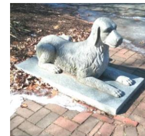
Left: Stone Dog II statue in front of the Forest Park Zoo