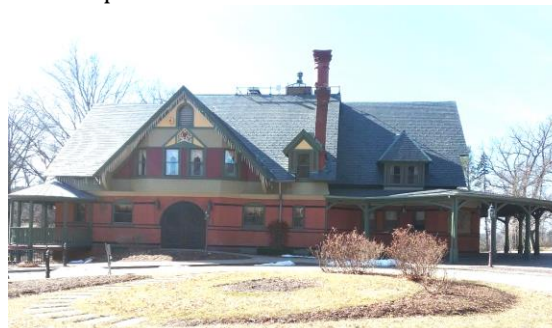
Carriage House from the estate that became Forest Park

The 10km & 6km routes have an AVA rating of 2B and are generally doable for strollers and wheelchairs. The routes are on paved surfaces and dirt paths.