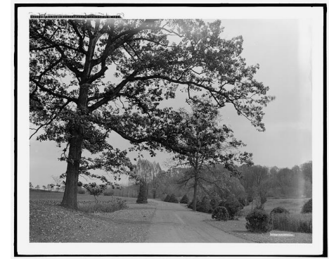
Forest Park, 1910-1920, Springfield, MA