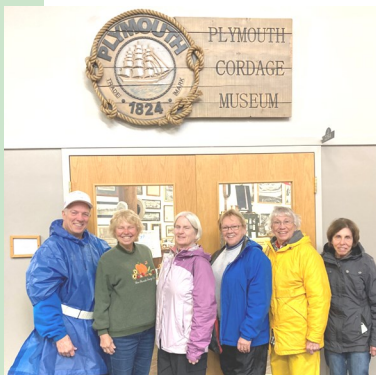
Right: on Nov. 30, with better clear weather, turnout at the Concord group walk exceeded expectations!