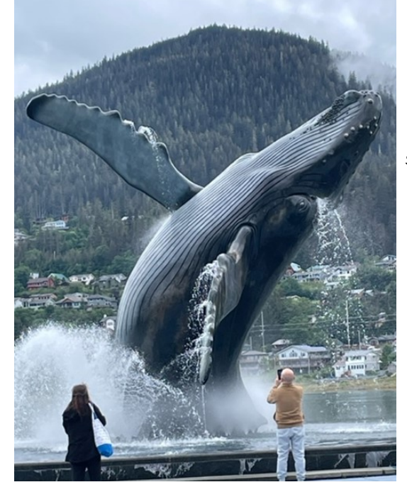
Humpback whale statue spraying water in Juneau Park

It was a very short trip, and I hope to return someday to see more of Juneau and actually try the famous Duck Fart shot at the Red Dog Saloon, ride the tram, and visit the glacier. But it was also a day full of surprises and beautiful views that I will remember for many years. Thanks to Tater Tours for a wonderful opportunity to see a sampling of an incredibly beautiful state!