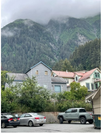
View of Juneau's hilly terrain

from the Tater Tour that had just finished the walk. They suggested some tips for the route – things the 5k covered that I would miss on the 10k and vice versa. I made note of their suggestions and took off. The walk starts up hill, as the city is nestled into several steep hills going down to the water. One goes past the capital building early on and then up a series of steps to a residential area with many lovely views of hills, deep green gorges with rushing water and then views of the very deep harbor.