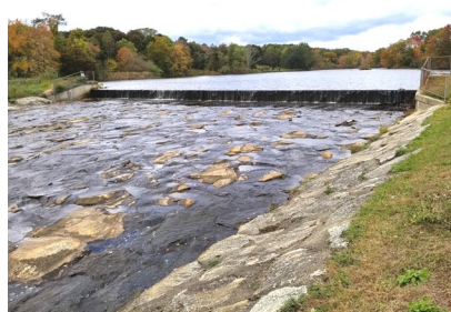
Top row: Louisa Lake on Oct. 20

It was a little chilly and a little damp to start the day, but the sun eventually peeked through and the 47 hearty souls that showed up for our day event in Milford had a great time, and I had fun seeing everyone. Thanks to all the volunteers who helped make this a great walk, and I hope to see everyone at the final day event of the year in Attleboro.