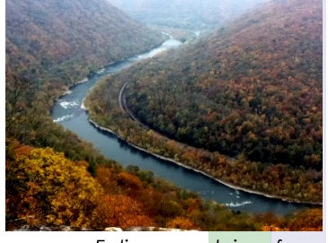
Foliage and river from high atop the bridge

The bridge walk operates every day of the year, winds permitting. And the walk is not the only secondary use of the bridge. One day each year the bridge is closed to traffic and some 200 thousand visitors gather to "celebrate" the bridge. Bungee jumpers bring elastic cords. Parasailers bring people-sized kites. Free fall jumpers bring parachutes. Rapellers bring climbing gear. Lesser adventurers just climb the rock walls of the gorge. And rafters frolic down below. All this attracts musicians, craftsmen, food vendors, and the curious. Generally a good time is had by all and cash infuses the local economy.