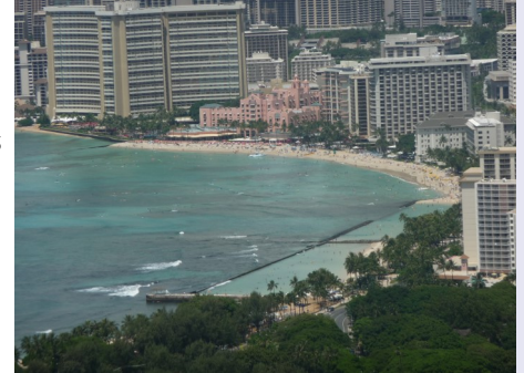
Waikiki from Diamond Head

by clambering through a horizontal gap in the rock about 2 ½ feet high. A few more steps brought us to the peak and a tall concrete structure that was originally a gun emplacement and which had a warning not to mount it. Several teenagers