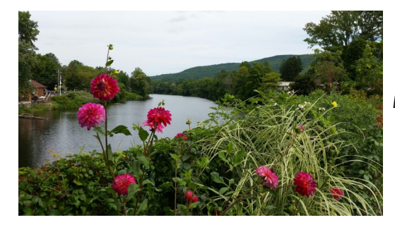
View from the Bridge of Flowers

Plan on spending your Columbus Day weekend with great 5km and 10km walks in Lenox, Shelburne Falls and Bennington, and enjoy the fall foliage as well.