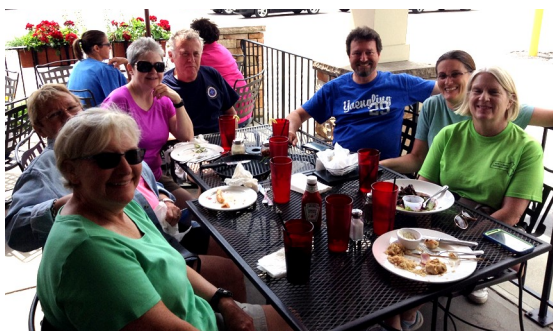
Left: Lunch was served following the Cumberland excursion