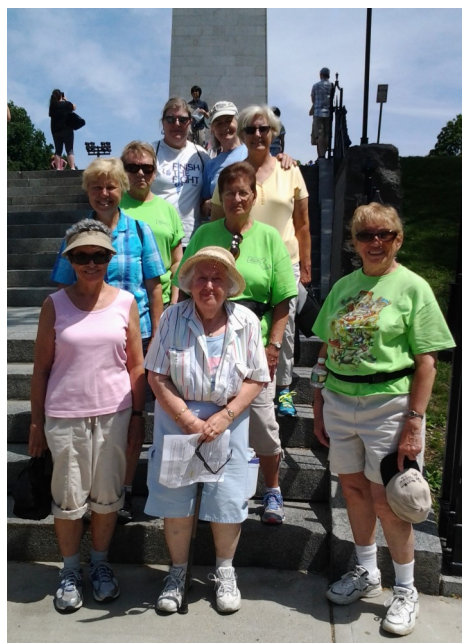
Right: Monumental rest spot for Freedom Trail walkers in Boston